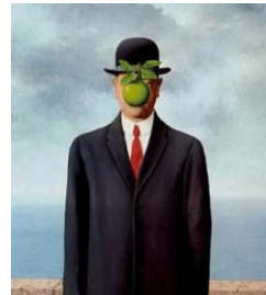
RENE MAGRITTE, "Son of Man" 1964