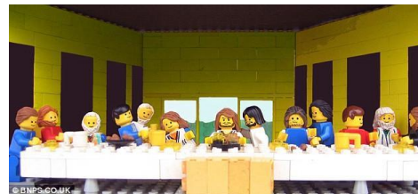
LEONARDO DA VINCI, "Last Supper" 1490's