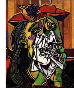
PABLO PICASSO, "Weeping woman" 1937