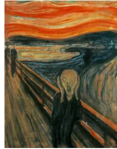
EDVARD MUNCH, "The Scream" 1893

You should plan and take your time with this activity over the summer. Make sure you photograph and present your alternative masterpiece. This will be collected in by your art teacher, via Google Classroom, during the first two weeks of term.