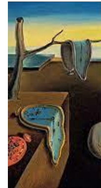
SALVADOR DALI, "The Persistence of Memory" 1931